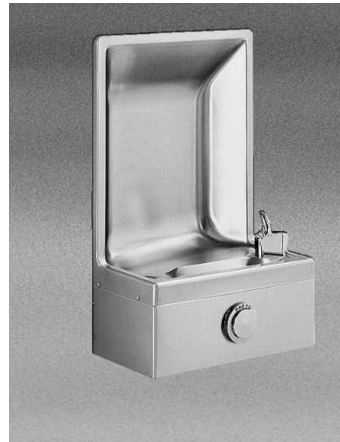
Model FLF200PM Shown