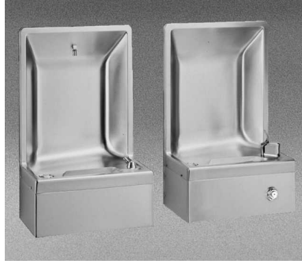
Model FLF202PM Shown