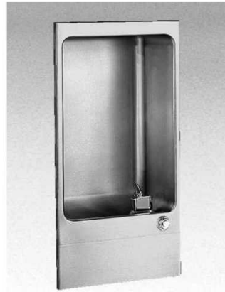
Model FLF211PM Shown