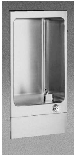
Model FLF240PM Shown