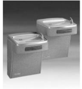
Model P8AMSL Shown

Serves children, adults, and the disabled for two-level dispensing of cold drinking water. Each unit features a touch pad; water flow continues as long as pressure on a pad is maintained.